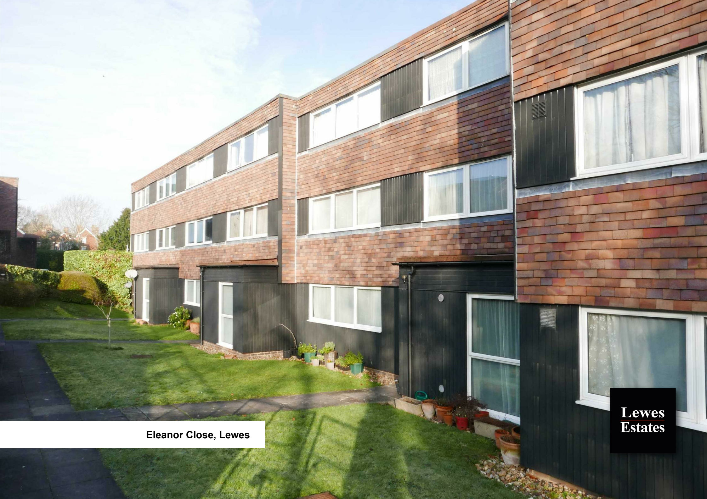
Eleanor Close, Lewes